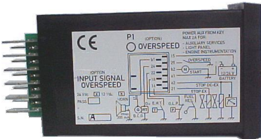
Side view: connection diagram